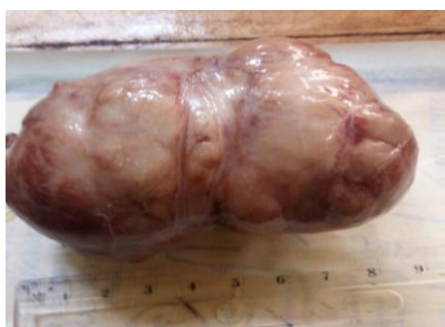
Figure1: An encapsulated firm to hard mass measuring 6 x 5x 3cm and weighing 25grams, serial sections showing grayish white solid surface.